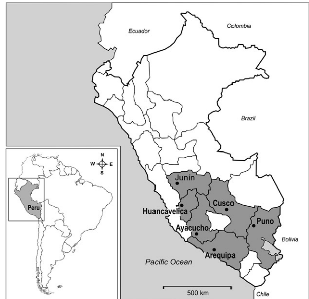
Fig. 1: geographic origins of Echinococcus granulosus isolates. A map of Peru displaying the regions in the country where samples were collected (gray regions). Inset shows location of Peru in relationships to all of South America.

Sequence analysis - PCR products were purified for sequencing using GFX PCR DNA Kit and Gel Band Purification Kit (Amersham Biosciences), following the manufacturer's instructions. The purified PCR products were sequenced using the BigDye Terminator v3.1 Cycle sequencing kit (Applied Biosystems) and analyzed by the genomic platform of DNA sequencing PDIIS/Fiocruz in an automatic sequencer ABI 3730 DNA Analyzer (Applied Biosystems), following the protocol described elsewhere (Otto et al. 2008). The chromatograms were analyzed and the nucleotide sequences obtained were aligned using the ClustalW method of the program MEGA 4.1 (megasoftware.net), using the sequences of the different genotypes of E. granulosus (G1, G2, G3, G4, G5, G6 and G7) and the microvariants of the G1 genotype (G1A, G1B, G1C, G1D, G1E and G1 1 , G1 2 , G1 3 , G1 4 ) deposited in the GenBank as references [accessions M84661/62/63/64/65/66/67 (Bowles et al. 1992), AF458871/72/73/74/75 (Kamenetzky et al. 2002) and EF393619, EF595654, EU178103, EU178104 (Vural et al. 2008)].