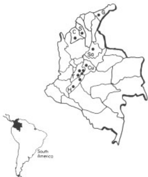
Fig. 1: map of Colombia showing focus of visceral leishmaniasis (G = Guajira, C = Córdoba, S = Sucre, Cu = Cundinamarca, Sa = Santander, T = Tolima, H = Huila).