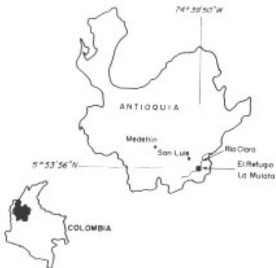
Fig. 2: location of Rio Claro region in department of Antioquia, Colombia.

The Rio Claro valley is classified as humid tropical forest (Espinal et al. 1978), although in the last 10 years the region has been modify by the massive destruction of the forest, rapid human population growth, and the concomitant development of new farmland and rural settlements.