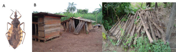
Fig 2: peridomestic ecotopes for Triatoma sordida (A). Wooden chicken coops (B) and wooden piles (C) presented in the peridomestic area of localities in the municipality of Posse, state of Goiás, Brazil.