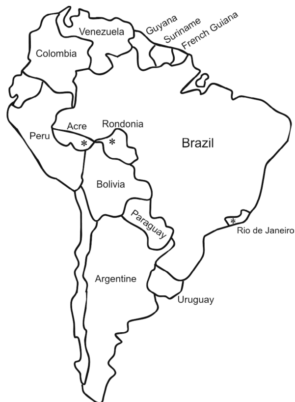
Fig. 1: map of Brazil, showing the areas from which DENV-3 viruses were isolated (*) and the borders of the countries of South America.

Sequencing strategy, multiple sequence alignment and phylogenetic analysis - The amplicons were directly sequenced using a Thermo Sequenase kit (USB Inc, Ohio, USA) on an ABI3100 device, with the Big-Dye7 Terminator method (Applied Biosystems, Warrington, UK). Nucleotide sequences were analyzed with a Phred/Phrap/Consed package (www.phrap.org). Sequences were obtained from the 5' and 3' UTR of the BR DEN3/290-02, BR DEN3/95-04, BR DEN3/97-04, BR DEN3/98-04, BR DEN3/RO1-02 and BR DEN3/RO2-02 samples after uncapping and RNA ligation, as described elsewhere (Duarte dos Santos et al. 2000). Primer sequences are available upon request.